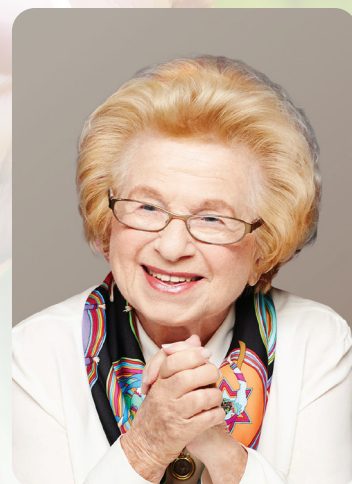
Dr. Ruth Westheimer